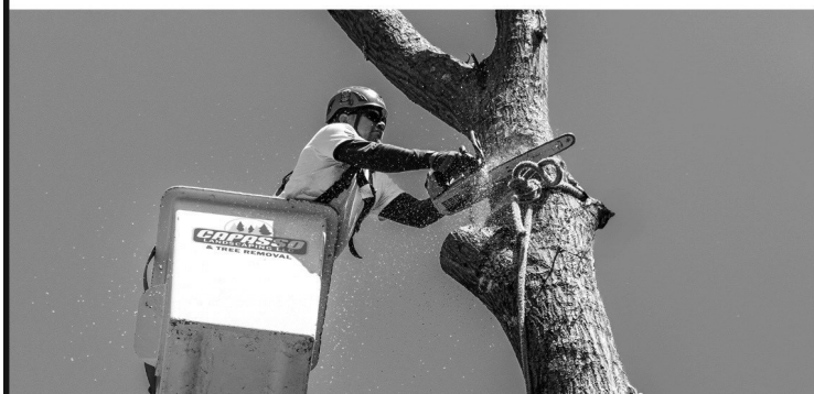
Tree Removal & Stump Grinding

New to Woodbridge? Call Capasso for your Annual Landscaping Maintenance Package