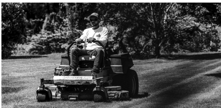
Annual Landscaping Packages

(203) 430-1555 www.capassolandscaping.com