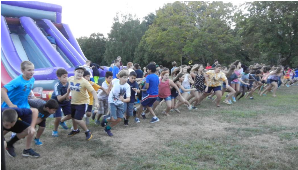
Woodbridge Youth Services hosts a picnic for Woodbridge and Bethany students to meet before entering 7 th grade together.

Woodbridge Government Access Television records and broadcasts many of the Town's board and commission meetings. Live meetings and recordings can be watched on Channel 79 (Cablevision), Channel 6109 (Frontier) or on WGATV's YouTube channel WGATV79.